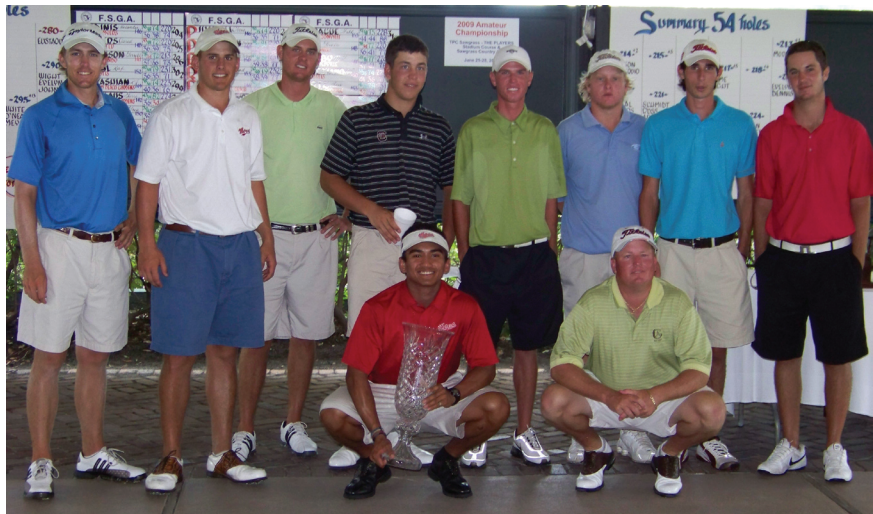
Amateur Championship Top Ten